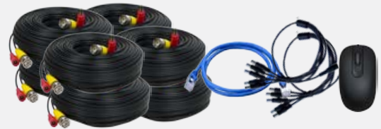
All required cabling for installation and network setup

Each camera streams at 2.0MP/1080p (1920 x 1080) and features a full metal housing, an IP67 weather rating for use outdoors, up to 50m infrared range and wide 90° captured field of view.