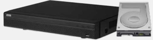
8 Channel 1080p HDCVI Digital Video Recorder

Records 1080p at 12fps and includes a pre-installed 2TB hard disk drive. This DVR also enables footage backup to USB device or via local network.