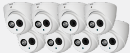
8 x 2.0 Megapixel Infrared Mini Dome Cameras

Records 1080p at 12fps and includes a pre-installed 2TB hard disk drive. This DVR also enables footage backup to USB device or via local network.