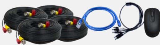
All required cabling for installation and network setup

Each camera streams at 2.0MP/1080p (1920 x 1080) and features a full metal housing, an IP67 weather rating for use outdoors, up to 50m infrared range and wide 90° captured field of view.